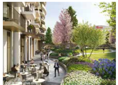
CGI is indicative only

The White City Opportunity Area is bringing 6,000 new homes and over 20,000 new jobs within the next five years. Some of the world's greatest brands in retail, media and education are transforming the site. At the centre of all this lies White City Living by St James.