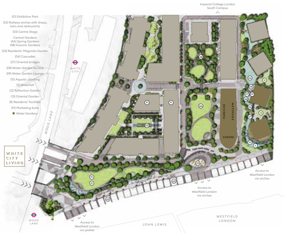
Map for illustration purposes only, not to scale. from W12 7RQ or White City/Wood Lane Stations.

academics and researchers, alongside established businesses and start ups, pushing the boundaries of science and technology. Television Centre, the home of BBC Worldwide, forms a major new business district dedicated to the creative industries including a 45-room hotel, White City House by Soho House and Bluebird Café among others.